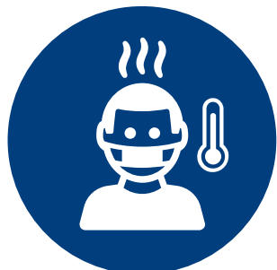
AVOID SICK PEOPLE