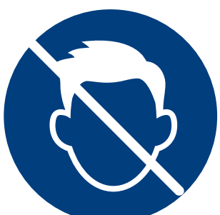
DON'T TOUCH FACE